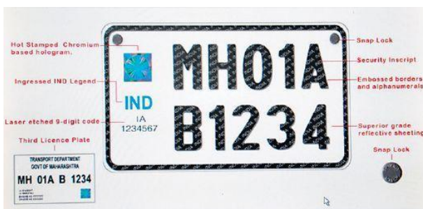
Fig 1. High Security Registration Plate.

In [5] The authors have used the basic morphological operations of skeleton, end points and thinning of binary images along with a standard LPR system. For recognition of characters three features of characters - holes, junctions and end points are used. The proposed method claims to achieve a success rate of 100 %.